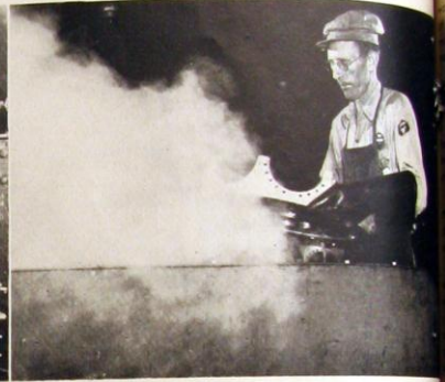
on one of the larger type aircraft engines. The serious look on their faces indicates the hard-working attitude they all have toward their respective jobs. The picture underneath, with the steam rising into atmosphere, is part of another unit of the teamlike work at Tinker Field. In this case, cleanliness is next to godliness as workman goes about bathing metal in Engine Repair. The center picture here, was focused on part of an aircraft engine being "tested" to show flaws that are not visible to the naked eye. If the part is defective it is turned in for scrap. Nothing is wasted. The bottom row picture shows a former housewife who has been trained in specialized work. When a job requires precision, the Air Service Command has found women adaptable and accurate. The lady is using a big wrench on the propeller shaft of an aircraft engine. Like thousands of others she, too, does a good job working hard and not for, the Air Service Command.

$1.00 IN WAR STAMPS FROM EVERY AMERICAN WILL BUILD THE SHANGRI-LA!