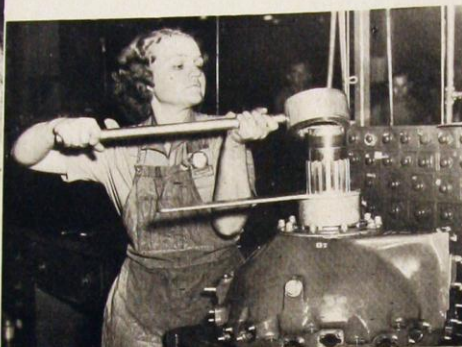
IT TAKES US ALL —Teamwork of all departments at the Oklahoma City Air Depot is "Keeping 'Em Flying." As each man of a bomber's crew depends upon each other in combat, so does each unit of the Oklahoma City Air Depot, model-of-the-world, depend on each other. Just about everything that man has developed to help "Keep 'Em Flying" is used at Tinker Field. The picture spread on this page shows some of the departments, that by taking great pride in their work, help to keep military aircraft in the air by "WORKING--ALL THE LIVE LONG DAY" --SO THAT DEMOCRACY MAY LIVE.